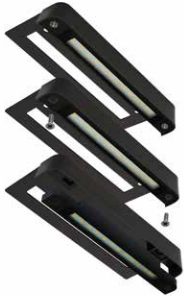
TS-A6000-BRZ/BLK $46.55 Replaceable LED Step & Wall Light

Designed to illuminate walls, steps, and outdoor kitchens. Available in a 7" width